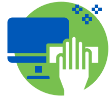
DISINFECT TOOLS & EQUIPMENT BEFORE & AFTER USE