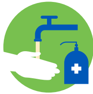
WASH OR SANITIZE HANDS