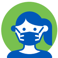
WEAR FACE COVERING (REQUIRED)